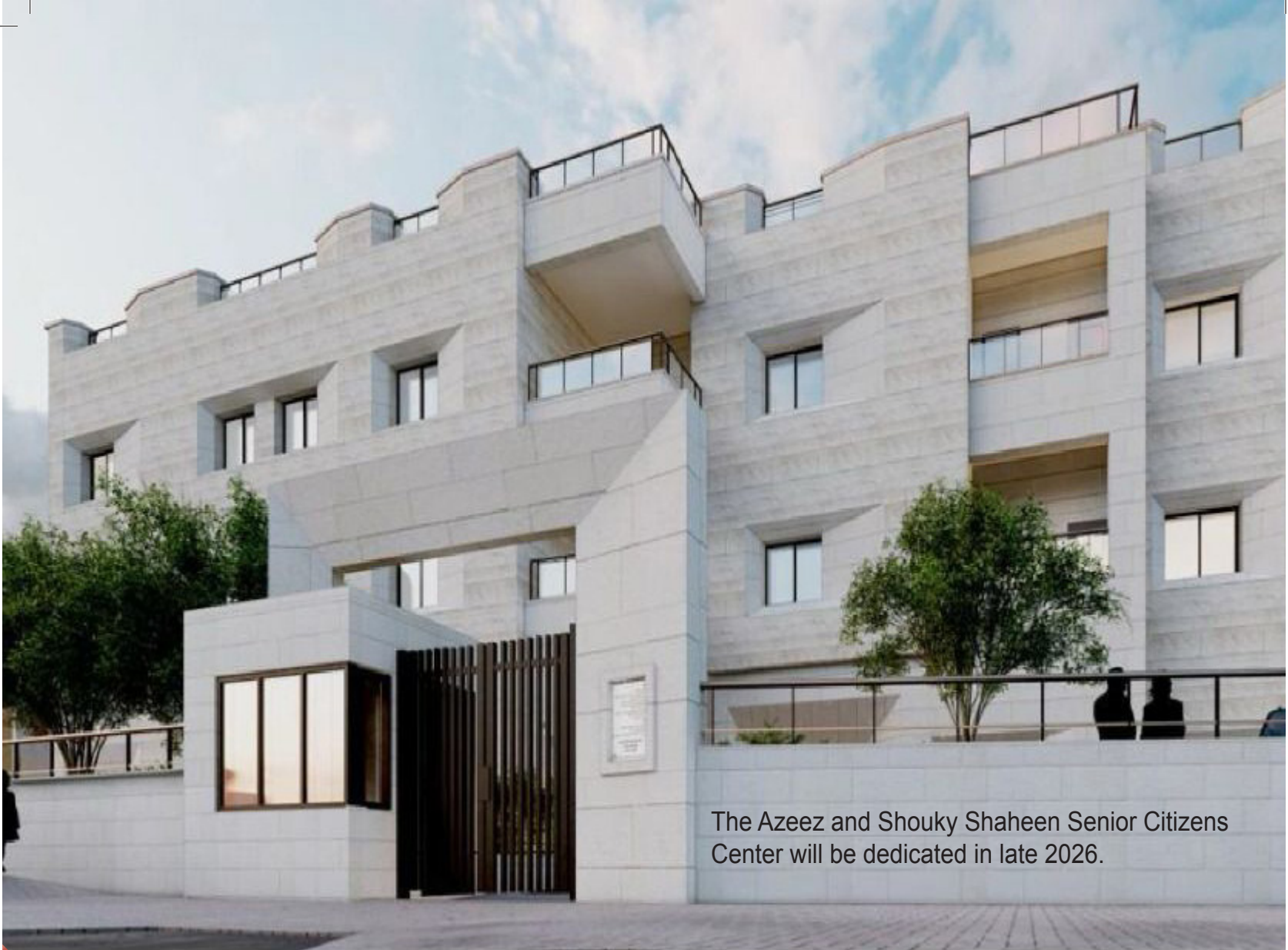
The Azeez and Shouky Shaheen Senior Citizens Center will be dedicated in late 2026.