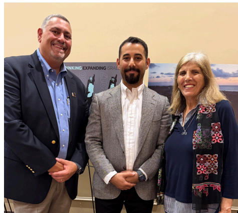
Day of Action 2.0 participants with Pulitzer Prize winning poet, Mosab Abu Toha

the Biden Administration and now with the Brookings Institution. Later that afternoon, we met with leaders at The Jerusalem Fund, where our advocates heard from the IMEU Policy Project and A New Policy to have deeper discussions about current legislation and specific member information.