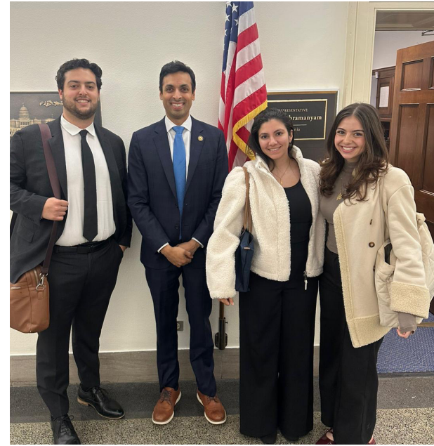
Day of Action November 2025

By joining forces with CMEP, the AFRP’s lived experience and community-rooted advocacy were