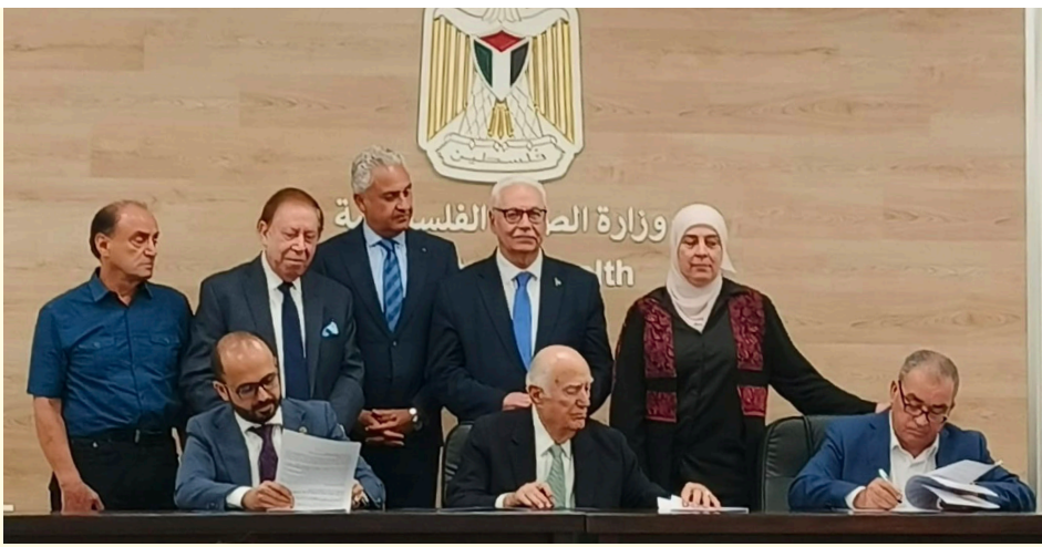
Signing of the agreement for the prosthetics program with Medical Mission, Ramallah Municipality, the Governor of Ramallah and other healthcare leaders.

By investing in people, training, and sustainable programs, the Medical Mission is elevating the entire healthcare system in Ramallah, Palestine.