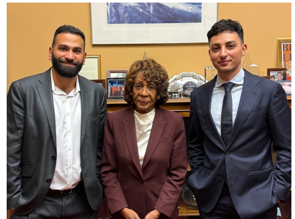
Day of Action participants with Congresswoman Maxine Waters (D-CA)

The final day of our event took our advocates to Capitol Hill for meetings with several members of