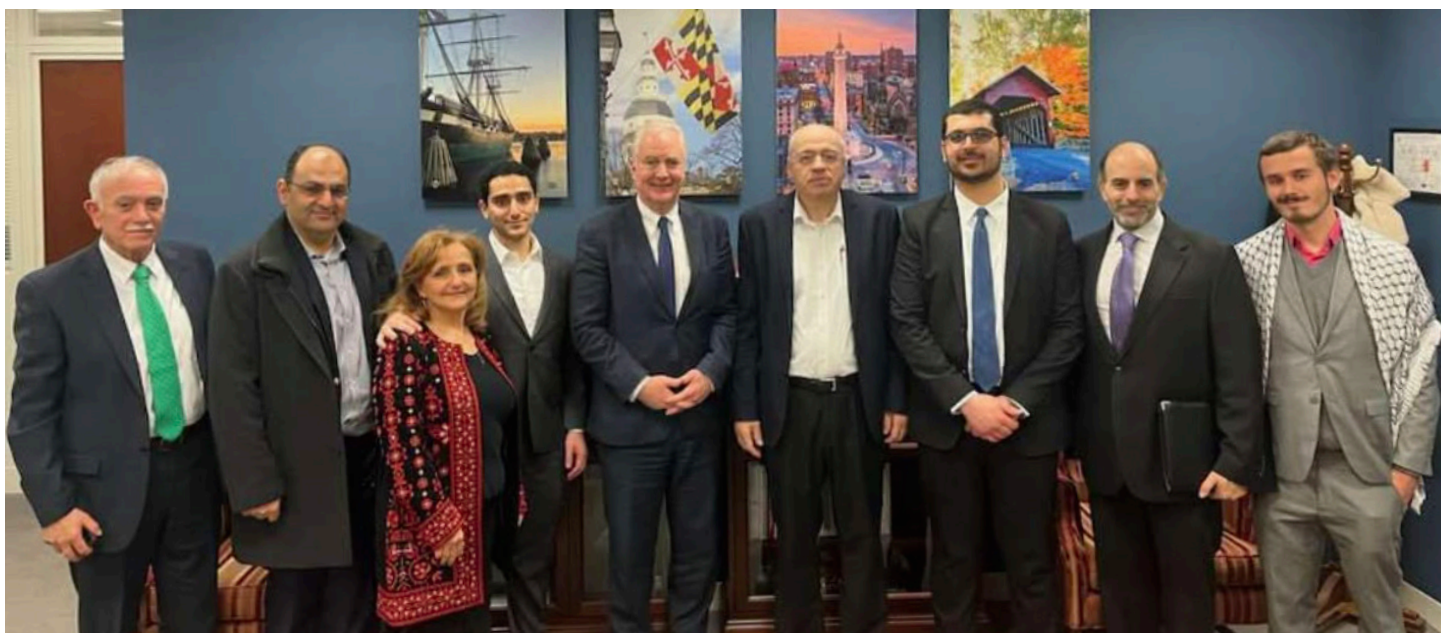
Palestinian Americans from Maryland, Virginia and DC met with Sen. Chris Van Hollen (Dem. Maryland) to discuss Palestinian rights.

Looking ahead, the AFRP aims to strengthen its local network in emerging states. In partnership with the Houston Ramallah Club, the AFRP plans to engage potential Senator James Talarico to explore collaboration at the state and federal levels — an important step in building AFRP's presence in Texas and supporting effective advocacy for Palestinian rights.