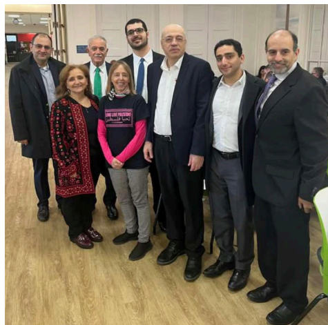
Members of the Maryland advocacy delegation