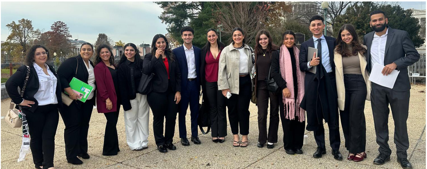
Participants from Day of Action November 2025

The annual Day of Action event emphasizes the strength and commitment of Palestinian American advocates working to ensure their concerns are heard on the Hill. Through continued relationship building and consistent outreach, the AFRP remains committed to continuing this work by supporting advocates from our community with opportunities for direct impact.