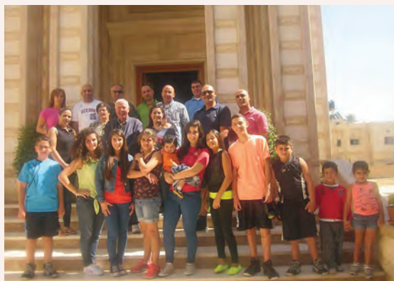
2017 - AFRP Debka Competition Winners

This charitable nonprofit 501c3 (ARFECF) corporation is chartered in the state of Michigan and is a separate entity of the Federation. Under the guidance of nine board members, the ARFECF's mission is to provide financial aid for the education and training of deserving students, as well as to contribute to educational institutions and civic organizations to further educational causes, and to provide for charitable and relief projects. Tax-deductible contributions fund this program.